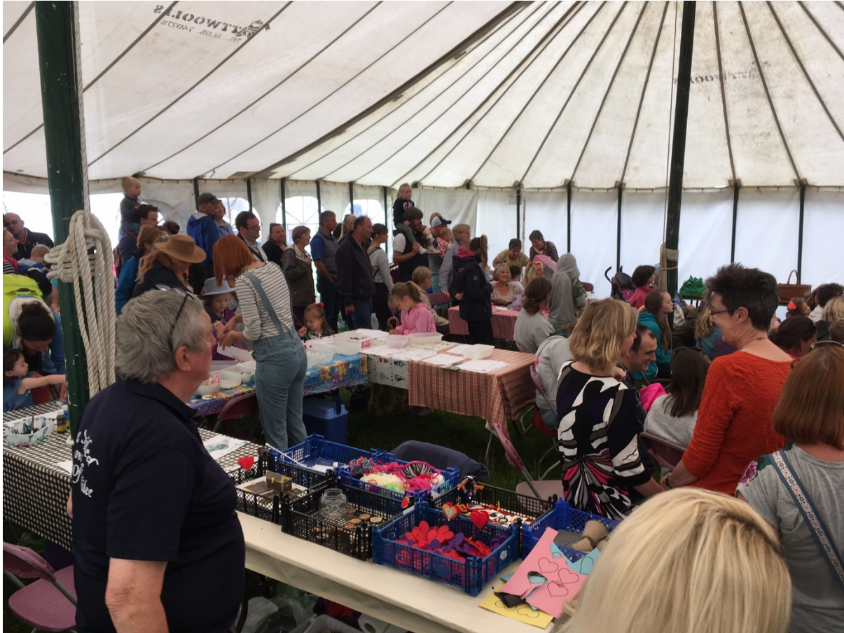
One of the big events on Gower is the Annual Gower Show at which the churches have a major presence

Tourism is a big player. The resident adult population of the two parishes is something over six hundred and fifty; holidaymakers, day-visitors, the occupiers of holiday homes and static caravans, and visitors to St Madoc's Christian Youth Camp multiply this to many thousands in the summer months. Many families have been visiting for generations, and are welcomed back as old friends. The visitors come for surfing, walking, equestrianism, seaside and country pursuits, and the pleasure of being in beautiful surroundings away from the rush of urban life.