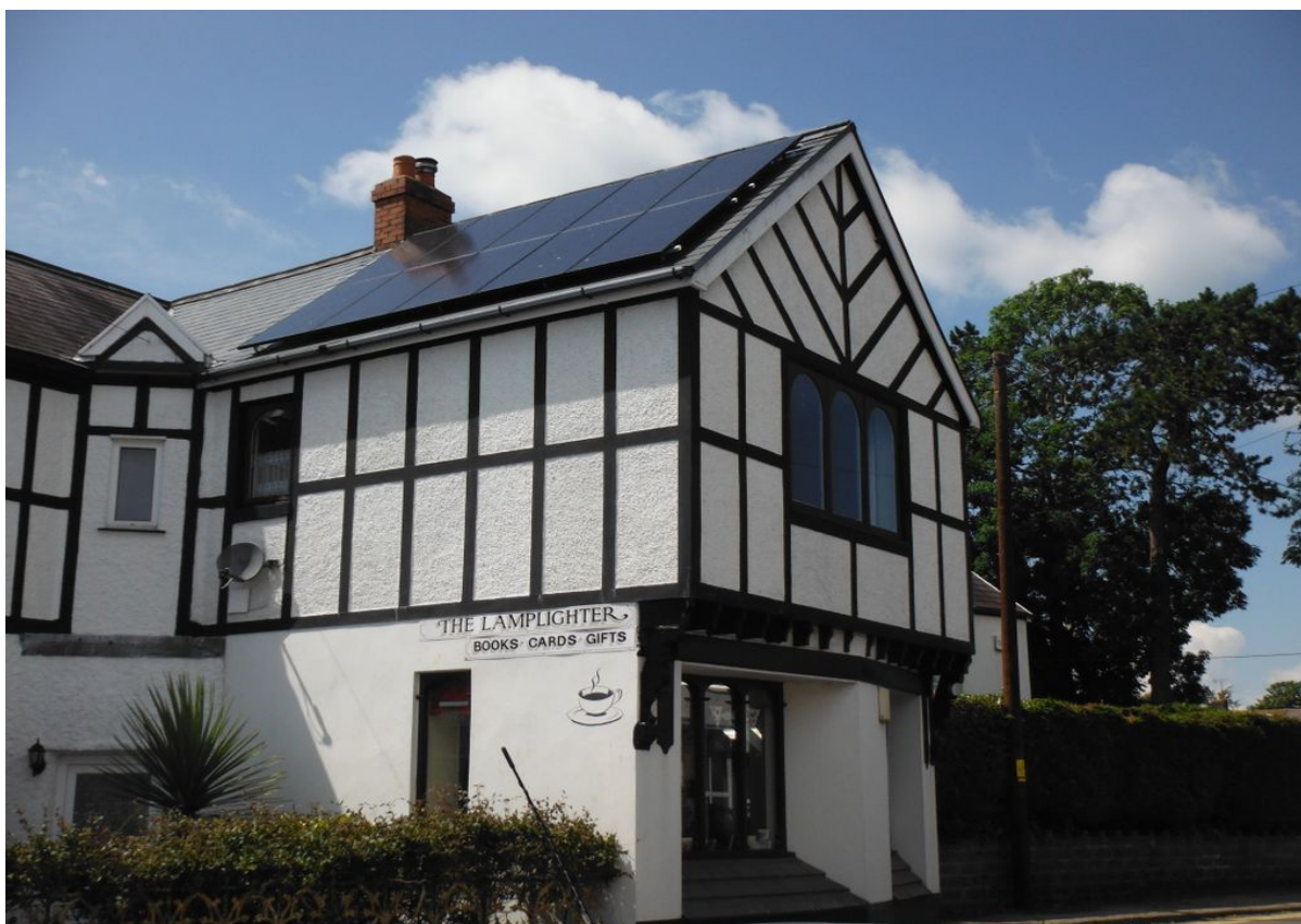
The Lamplighter Christian Bookshop, gift shop and Coffee Shop in the heart of Bishopston Village