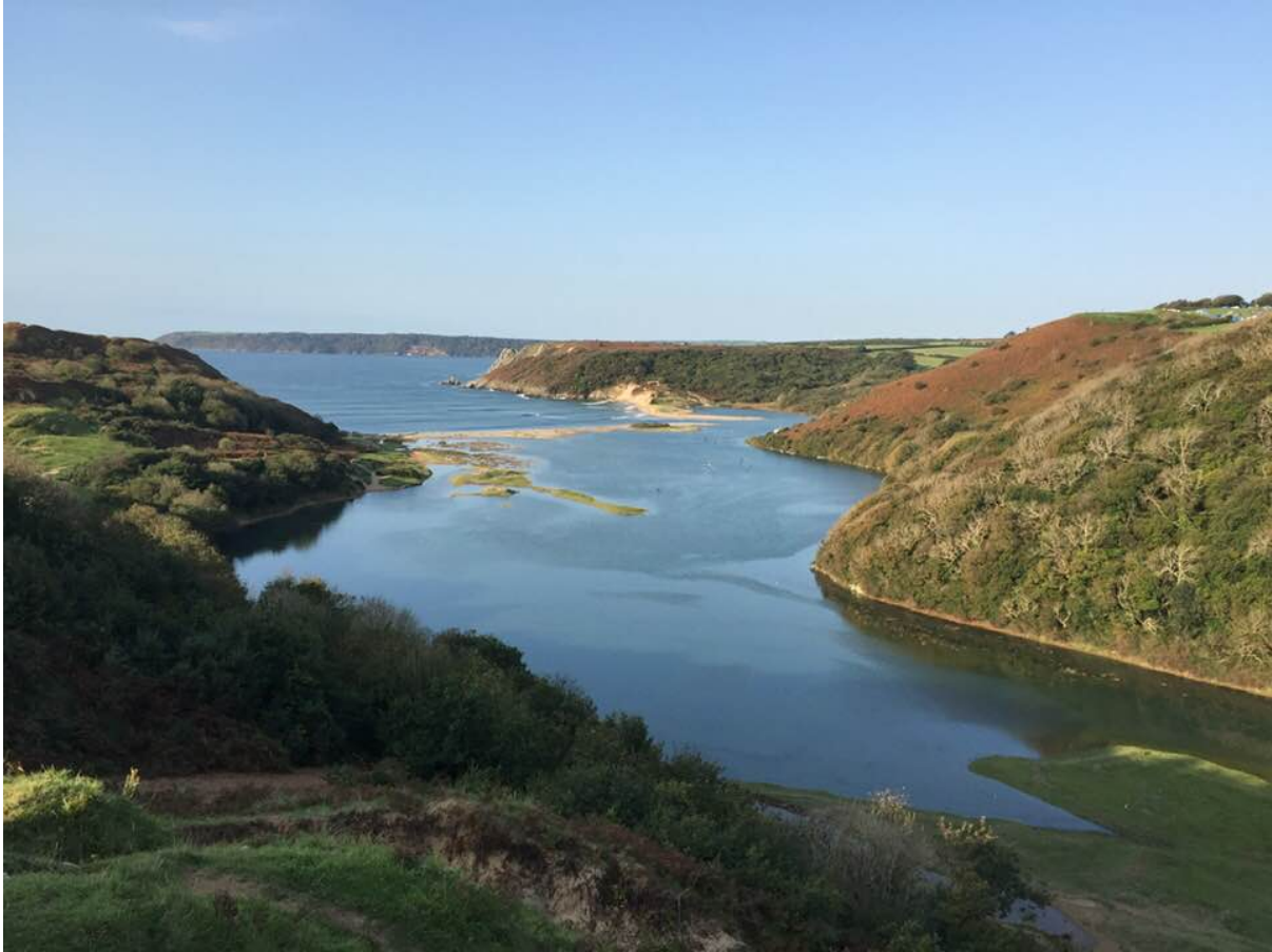
Three Cliffs near Pennard

We are a very broad church across the Ministry Area and are inclusive in our outlook and have a variety of churchmanship and styles of worship. We are however, open minded enough to know that plans we make now may not be the ones we need next year or the year after to lead us forward in renewing the faith of God's people here on Gower as we reach out to bring others to faith as well. Therefore our plans and goals will be under review and we will act with boldness in establishing a prayerful vision guided by God's Holy Spirit to establish His Kingdom here in the place where we are blessed to serve.