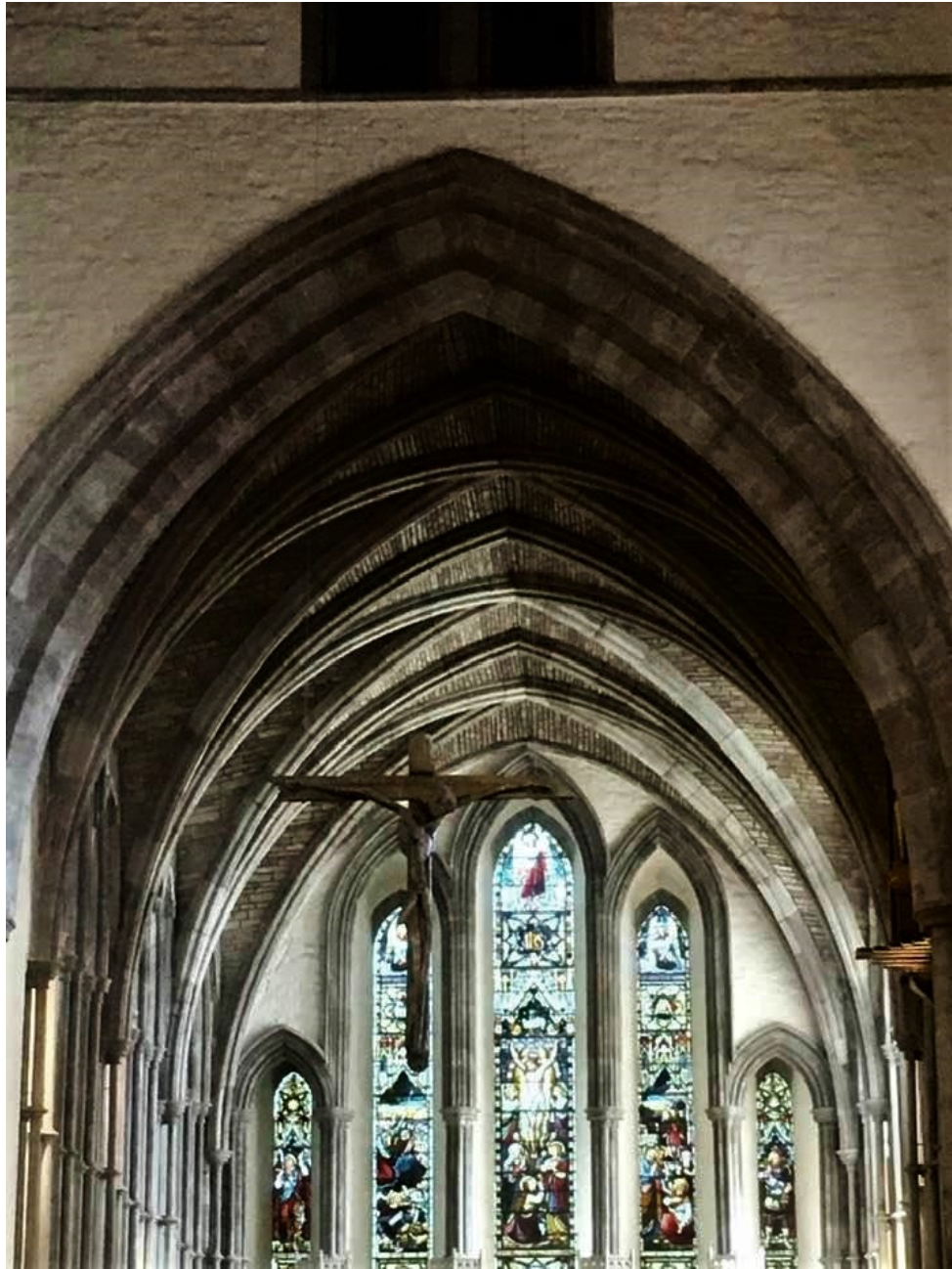
Inside the Cathedral at Brecon the Mother Church of the Diocese

01 Community.... there is a commitment to mission within the ministry area which understands the character and needs of the local communities and there is a willingness to change and adapt