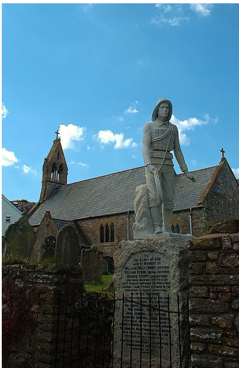
Lifeboat Memorial at Port Eynon Church

http://www.stmadoc.co.uk/ St. Madoc Christian Camp