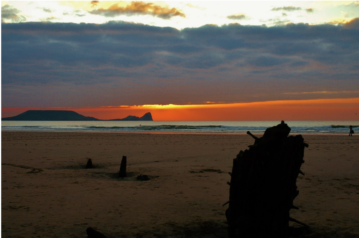
Sunset at Rhossilli Beach

http://swanseaandbrecon.churchinwales.org.uk/