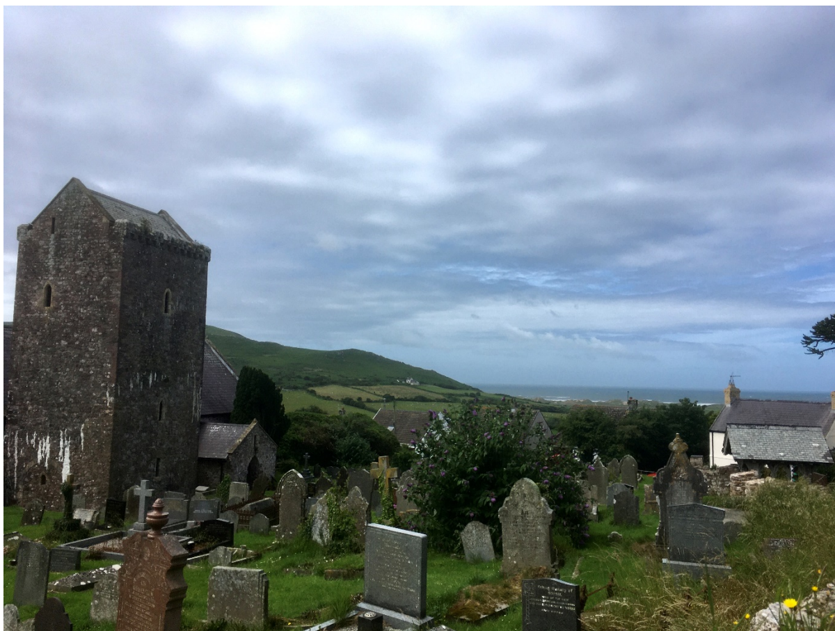
St Cenydd's Church, Llangennith