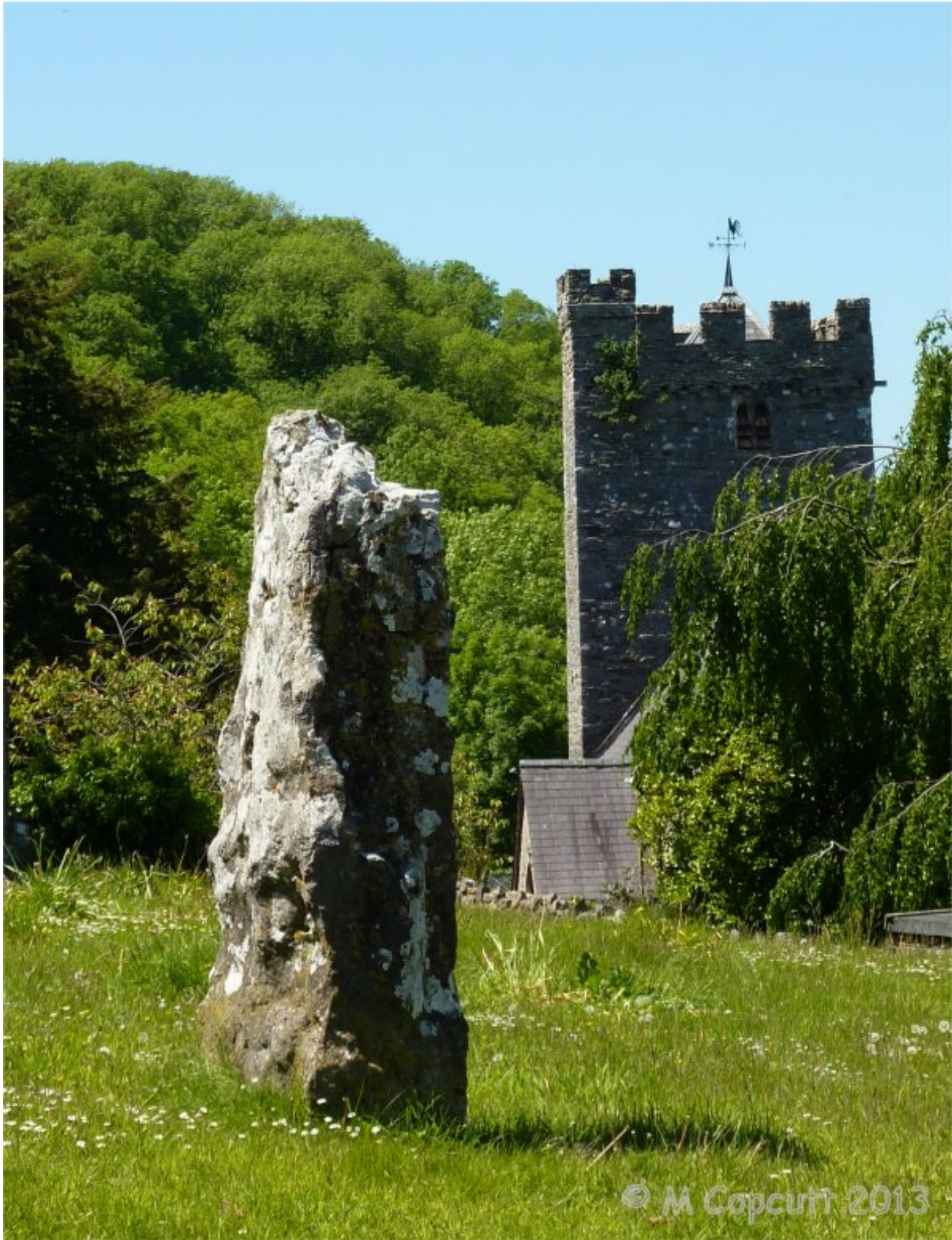
The Church at Llanrhidian above the North Gower Marshes