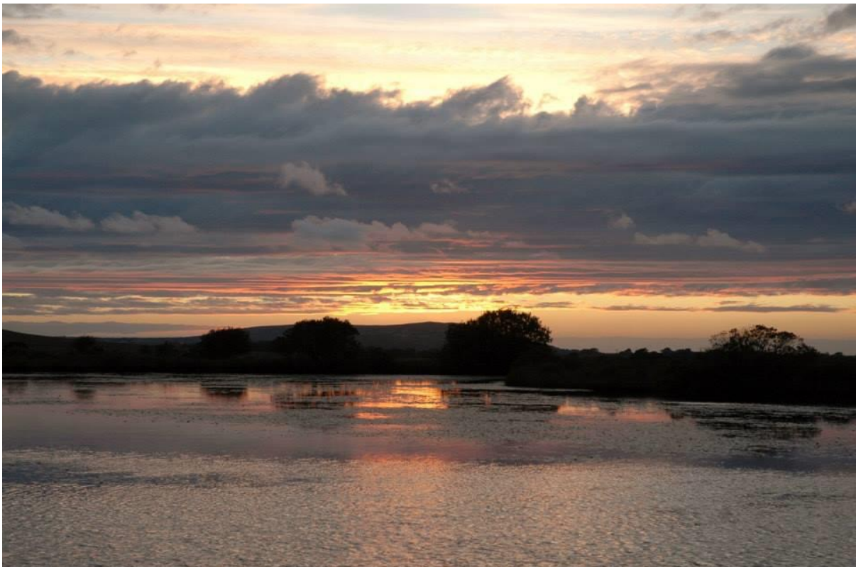
Broad Pool Cefn Bryn

Expenses of office will be met by the Ministry Area.